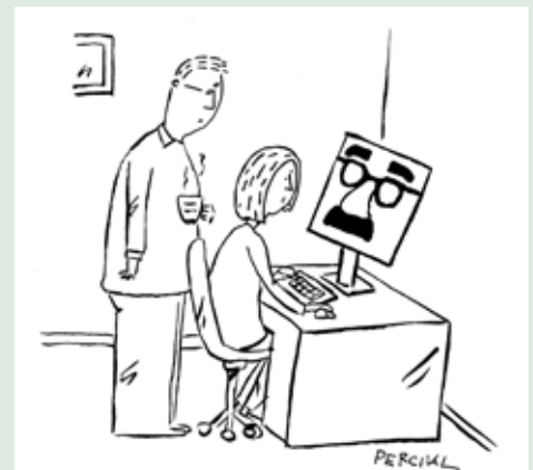
“The computer’s acting funny.”