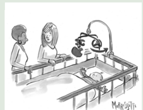
“Alexa picked it out.”